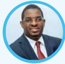
Hon. Omar Said Shaaban,

Minister of Trade and Industrial Development, Revolutionary Government of Zanzibar