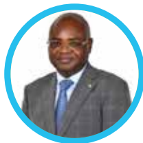
Hon. Kitila Mkumbo, Minister of State in the President's Office - Planning and Investments