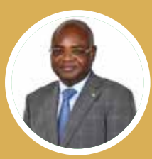
Hon. Kitila Mkumbo, Minister of State, President's Office – Ministry of Investment and Planning