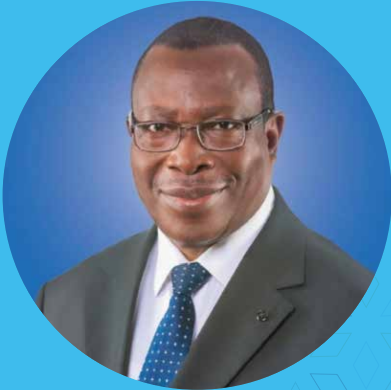
Hon. Dr. Philip Isdor Mpango Vice President of the United Republic of Tanzania