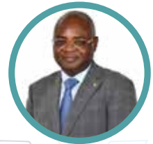
Hon. Kitila Mkumbo, Minister of State in the President's Office - Planning and Investments

Hon. Kitila Mkumbo, an esteemed politician and academic, presently holds the Minister for Planning and Investment position. Serving as an MP for Ubungu constituency since 2020, he previously acted as the Minister of Industry and Trade. With a 21-year civil service background, he has contributed significantly to Education and Psychology research.